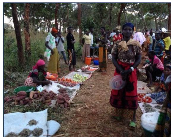
Nyarugusu, market set up by Burundian refugees, June 2015